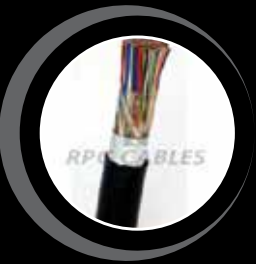
Jelly Filled Copper Cables