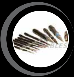
Low Tension (LT)