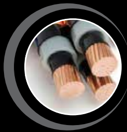
High Tension (HT)