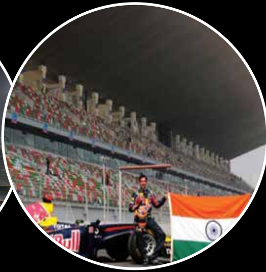
BUDDH INTERNATIONAL F1 CIRCUIT